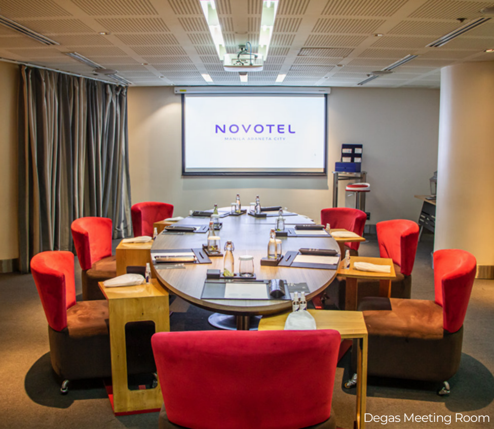
Degas Meeting Room